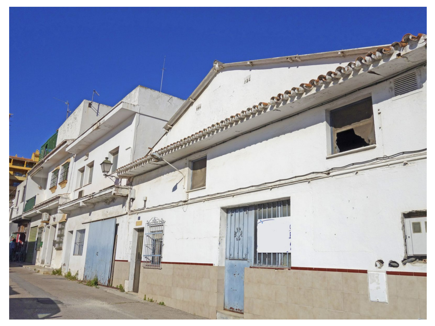
Bedrooms: 7 Status: Sale

Bathrooms: 1M²: 600Property Type: CommercialParking places: by request