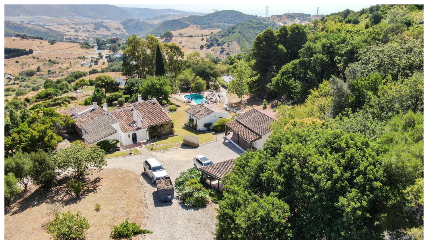
Спальни: 6 Статус: Продажа