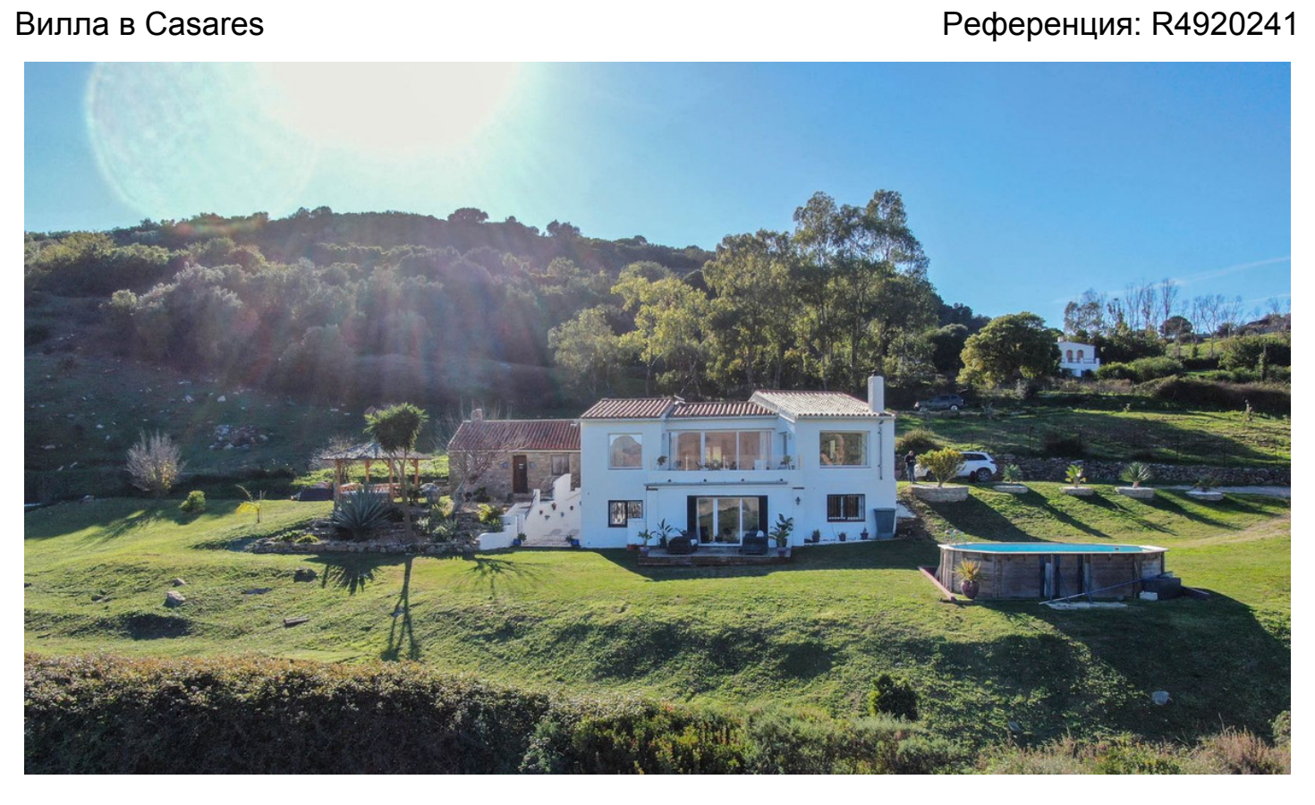
Спальни: 4 Статус: Продажа