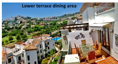
Lower terrace dining area