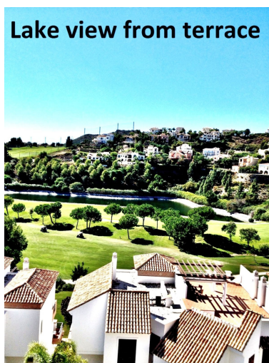
Lake view from terrace