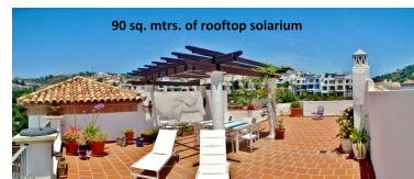
90 sq. mtrs. of rooftop solarium