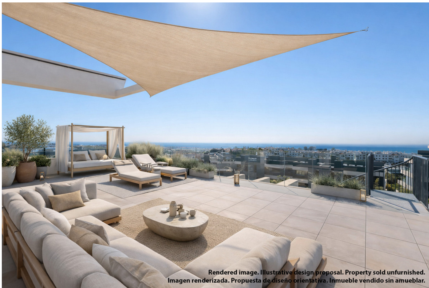
Rendered image. Illustrative design proposal. Property sold unfurnished. Imagen renderizada. Propuesta de diseño orientativa. Inmueble vendido sin amueblar.